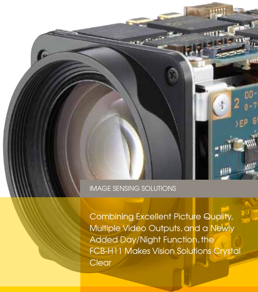
IMAGE SENSING SOLUTIONS

Combining Excellent Picture Quality, Multiple Video Outputs, and a Newly Added Day/Night Function, the FCB-H11 Makes Vision Solutions Crystal Clear